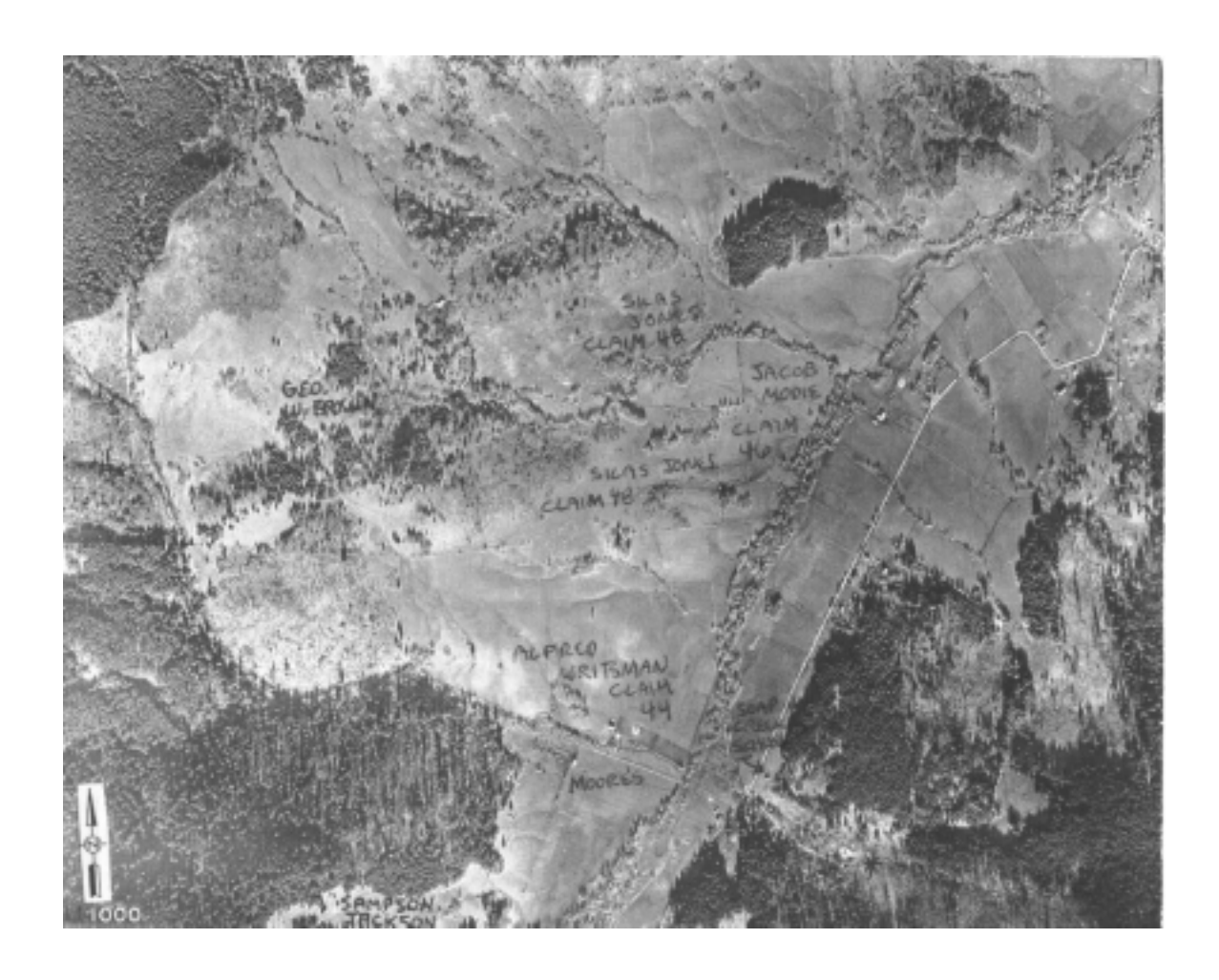
Fig. 29. Southern Soap Creek Valley, c.1936. Note locations of orchards, homes, and fenced crops in relation to pioneer land claims (Maps 2 and 11; Fig. 25). Also note location of logging camp in lower right corner and compare with Map 15. This photograph can be correlated to locations of several Soap Creek Valley oral history informants and mapped tours and to local landowners at the time the photograph was taken (Map 9; Tables 2 and D.3; Hindes 1996).

<u>Berg 1983</u>; Loew 1993; <u>Rowley 1996</u>). After the war, most Soap Creek Valley land owned by the Army was sold to OSU (<u>Dunn 1990</u>; <u>Davies 1997</u>; see Map 3) and remaining government properties were purchased by a few farmers and real estate speculators (<u>Glender 1994</u>). The residential population of The Valley temporarily remained lower than levels of the 1920s and 1930s.