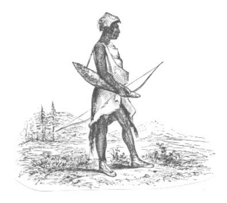
Fig. 5. Sketch of Kalapuyan male near Marys River tributary, 1841 (Wilkes 1845). This drawing was made by A. A. Agate near present-day Monroe, Benton County, OR (Zybach 1989). The foreground and background plants represent conditions typical of much of the western Willamette Valley and eastern slope Oregon Coast Range during presettlement time (Boyd 1986), including most Soap Creek Valley floodplain and foothills prior to 1846.

in these human activities likely contributed to increased: afforestation of Willamette Valley meadows and prairies (Fig. 6); populations of local game animals (Sondenaa 1991); and incidence of coarse woody debris on forest floors and riparian areas (Crosby 1986). However, these effects began to occur nearly 15 years before initial settlement of Soap Creek Valley by white and black American immigrants in 1846 (Fagan 1885; Moore 1947; <u>Rawie 1995</u>; see Table D.2) and were unnoted in oral histories used for this study.