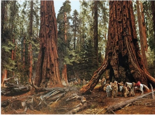
April 2 Guidebook (1): California Redwoods May 2 - June 22, 1828