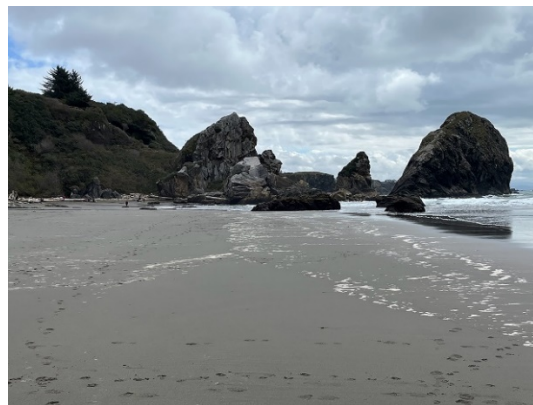
Harris Beach looking south.

Our first coastal stop in Oregon was Harris Beach State Park where we discussed the broken cliffs and stretches of sandy beaches that extend from northern California to Vancouver Island and still show the dramatic effects—and distinct travel barriers—that remain from the January 26, 1700, Cascadia earthquake and ensuing tsunami. This catastrophic event has been precisely dated using Japanese tsunami documentation and tree-ring analyses of submerged trees. Survivor accounts undoubtedly remained in the generational memory and stories of the native people Smith encountered. Smith's pack trail was the first along the southern Oregon Coast—memorable for its sheer cliffs and deep brush-filled ravines. Much of today's Highway 101 follows this route, but the oral histories are forever lost.